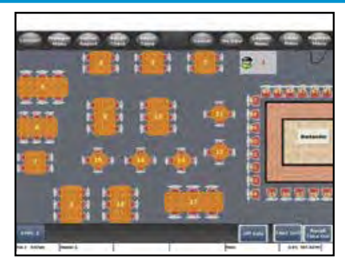
Customized graphical table maps.