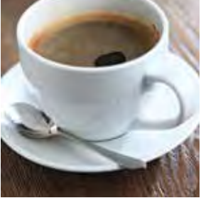
Bars / Ice Cream Parlors / Coffee Shops