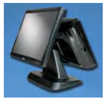
Optional Integrated 15" Rear LCD Customer Display (NCC Reflection POS for Windows)