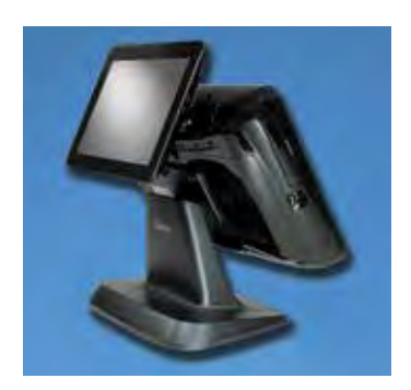
Optional Integrated 9.7" Rear LCD Customer Display (NCC Reflection POS for Windows)