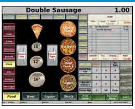
Graphic screens guide operators with minimal training.

The NCC Reflection POS delivery module will allow guest checks to be created and assigned to customers for delivery. NCC Reflection POS can maintain a customer file of 9,999 entries which can be accessed and sorted by customer ID number, phone number, address, first and last name or by city. NCC Reflection POS can create and store new customers on the fly during a first time purchase. When used with PC WorkStation NCC Reflection, POS can automatically retrieve order history allowing for fast and accurate order entry. Guest checks created for delivery are