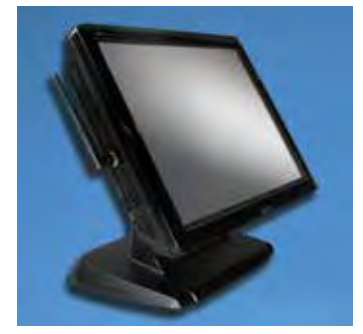
Optional WiFi Module (NCC Reflection POS for Windows)