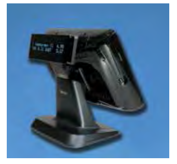
Optional Integrated Rear VFD Customer Display